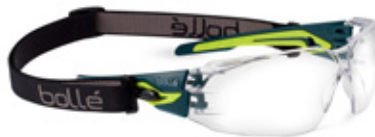
SILEXPPSI + UNIVSTRAP