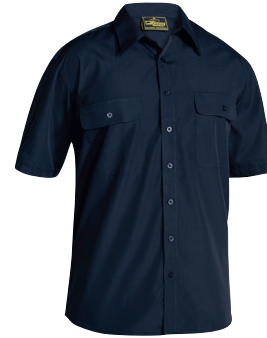
BS1526 PERMANENT PRESS SHIRT LS