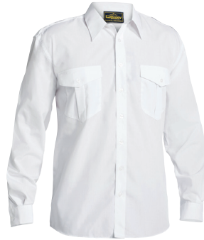
B76526 EPAULETTE SHIRT LS