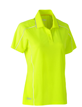
BKL6225T BKL1425 WOMEN'S TAPED TWO TONE WOMEN'S COOL MESH POLO HI VIS V-NECK POLO LS SHIRT WITH REFLECTIVE PIPING