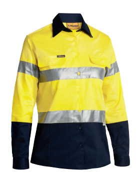
BLT6456 WOMEN'S 3M TAPED HI VIS DRILL SHIRT

BL6896 WOMEN'S 3M TAPED 2T HI VIS COOL LW SHIRT LS