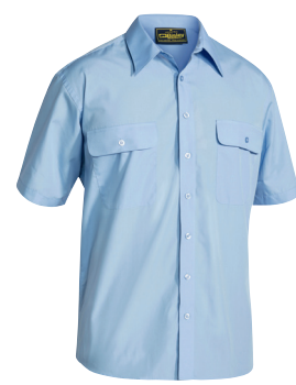
B$1526 PERMANENT SHIRT SS