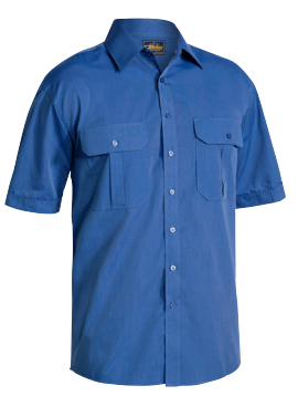
BS1031 METRO SHIRT SS