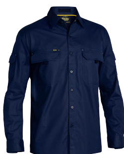
BS6414 X AIRFLOW™ RIPSTOP SHIRT LS