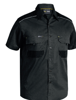
BS1133 FLX & MOVE™ MECHANICAL STRETCH SHIRT SS