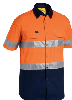
BS1415T 3M TAPED 2T HI VIS X AIRFLOW™ RIPSTOP SHIRT SS