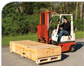
1. Position crate for assembly