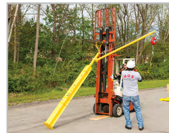
4. Raise telescoping mast