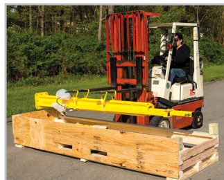
3. Remove telescoping mast