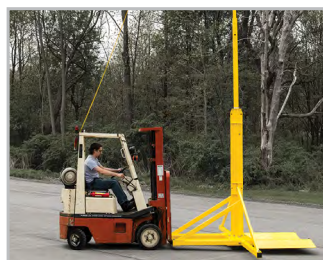
7. Move SkyORB into position