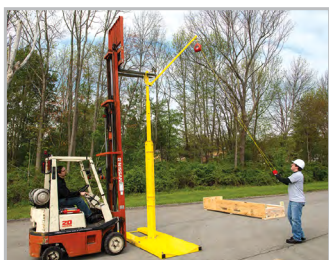
5. Position telescoping mast on base