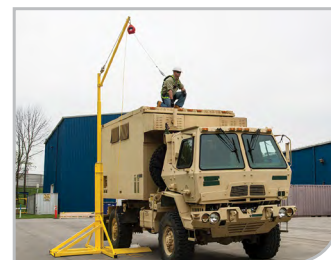
8. System ready for use