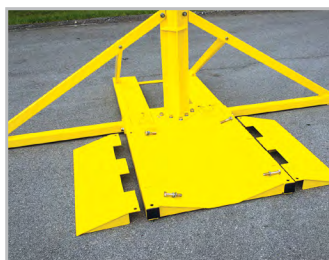
6. Complete anchor base assembly