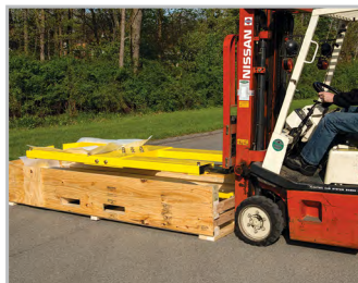
2. Remove base