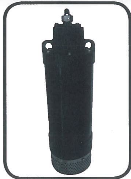
Submersible Dewatering 2" NPT & 3" NPT Female

Following a series of processes, ending in a controlled bake, the winding is 100% impregnated and sealed. VPI is greatly superior to the "dip and bake" method which may provide only 50% to 70% of effective insulation leaving voids and air pockets. VPI provides 100% solid mass structure which provides the greatest mechanical strength and a cooler running motor due to superior heat dissipation.